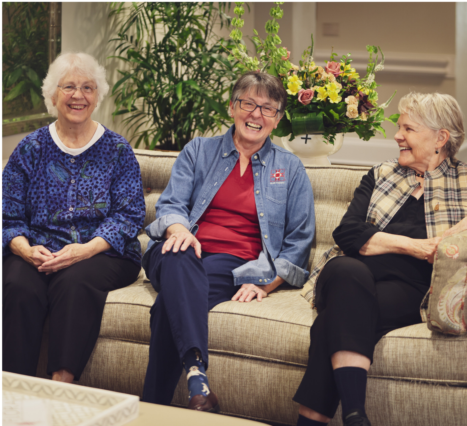
GALLOWAY RIDGE AT FEARRINGTON